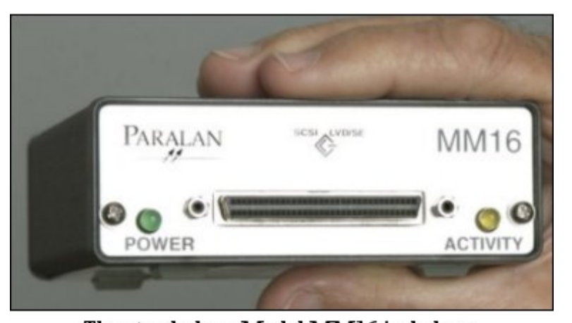
The stand-alone Model MM16 includes a desktop power supply for line voltage operation.

SCSI Multimode Expander Extends the SCSI Bus Length of an LVD/MSE System